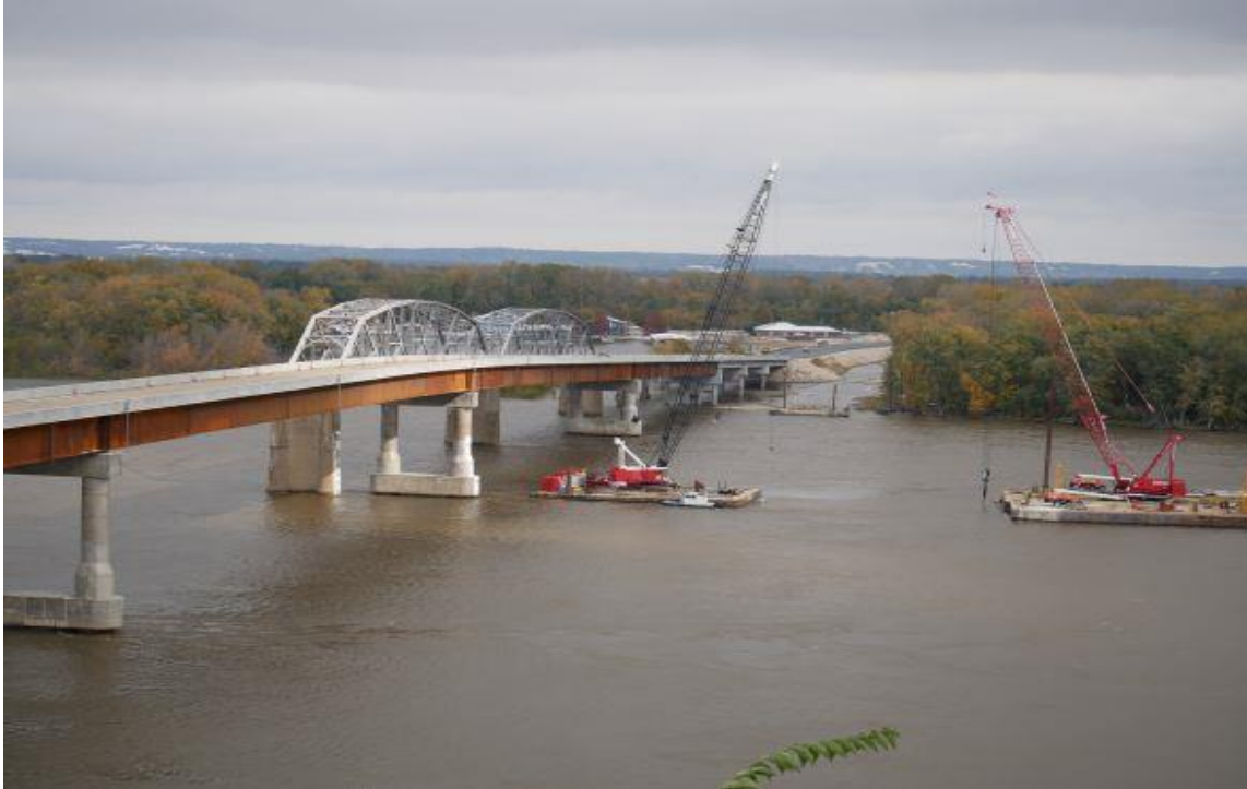
Hwy 54 Bridge over the Mississippi River Louisiana, MO