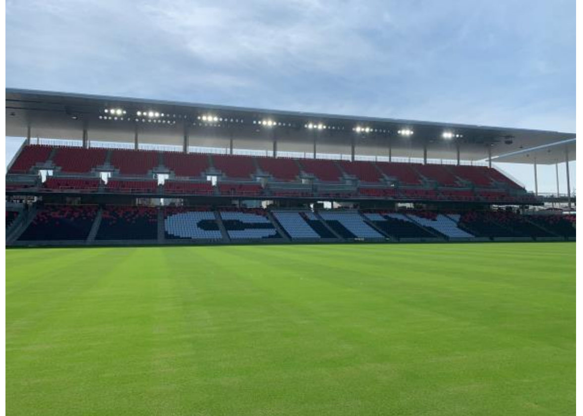
St. Louis Citypark MLS Stadium, St. Louis, MO