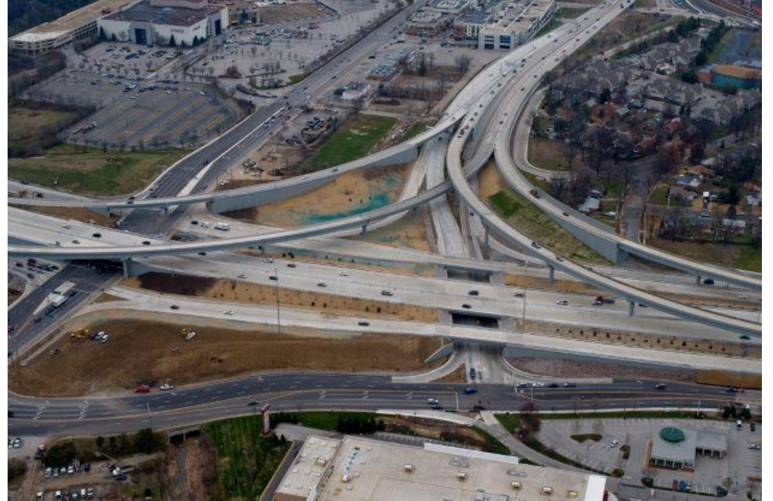
I-64 and I-170 Exchange, St. Louis, MO