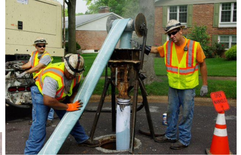
Cured-In Place Pipe (CIPP)