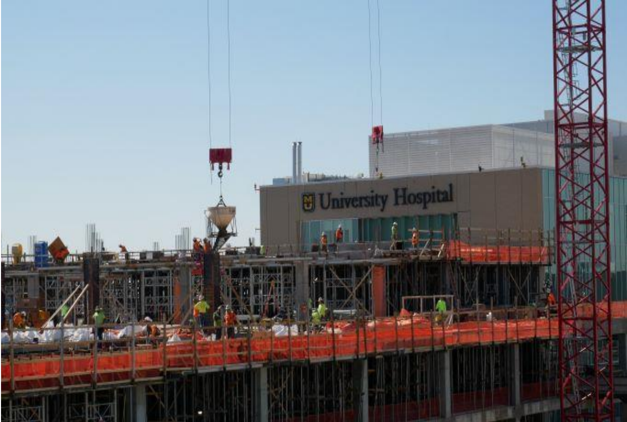
MU Healthcare Children's Hospital, Columbia, MO